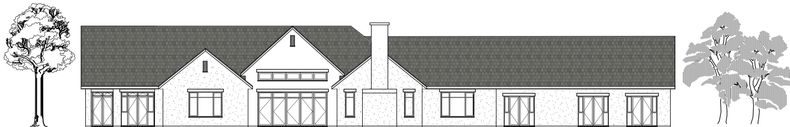
2470 X 2400 2470 X 2400 1800 X 2400 2470 X 5000 1800 X 2400 1800 X 2400 2170 X 2200 2170 X 2200 2170 X 2200 NORTH ELEVATION 1:100